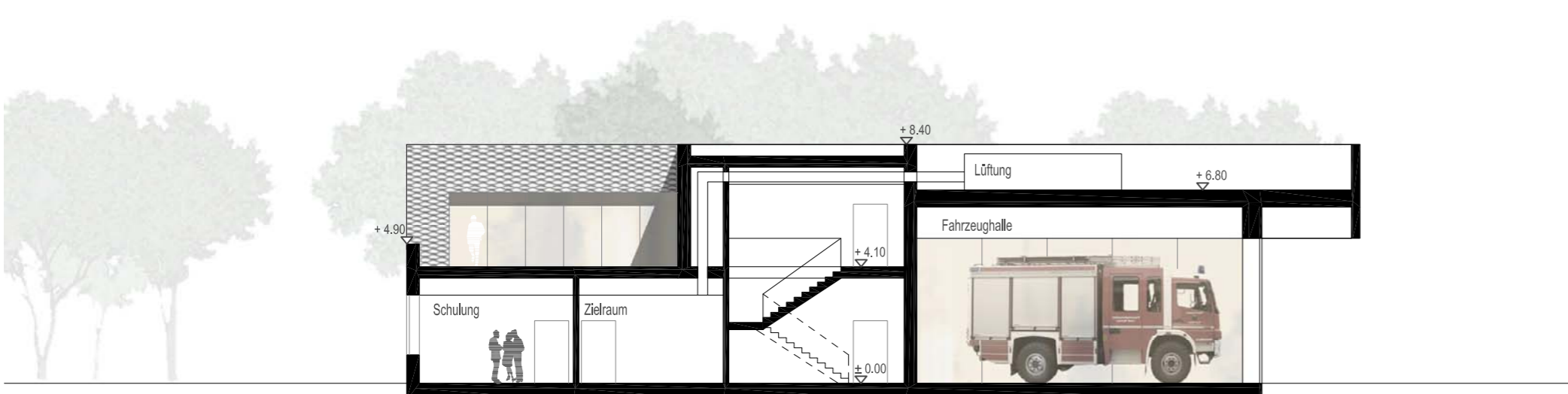
Schnitt A-A 1|200