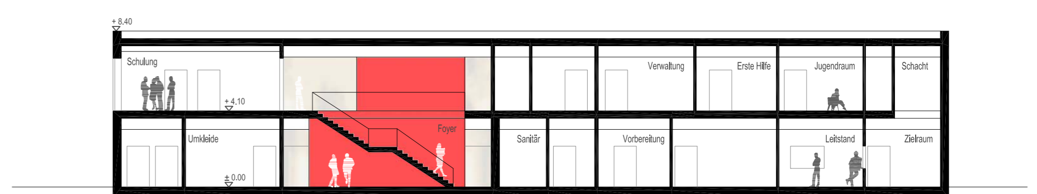
Schnitt B-B 1|200