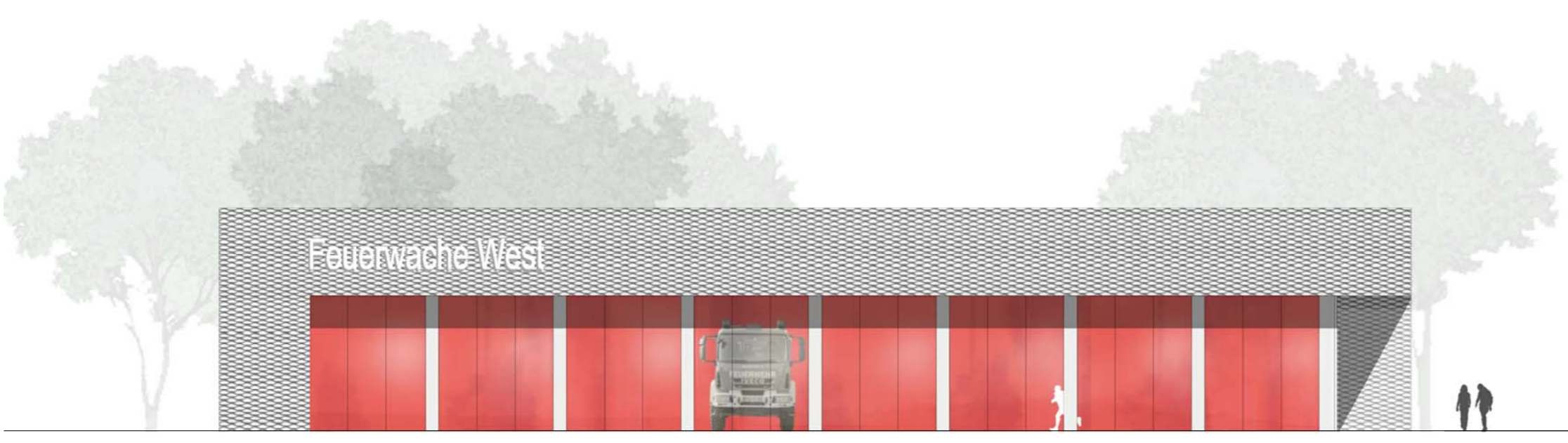
Ansicht West 1|200